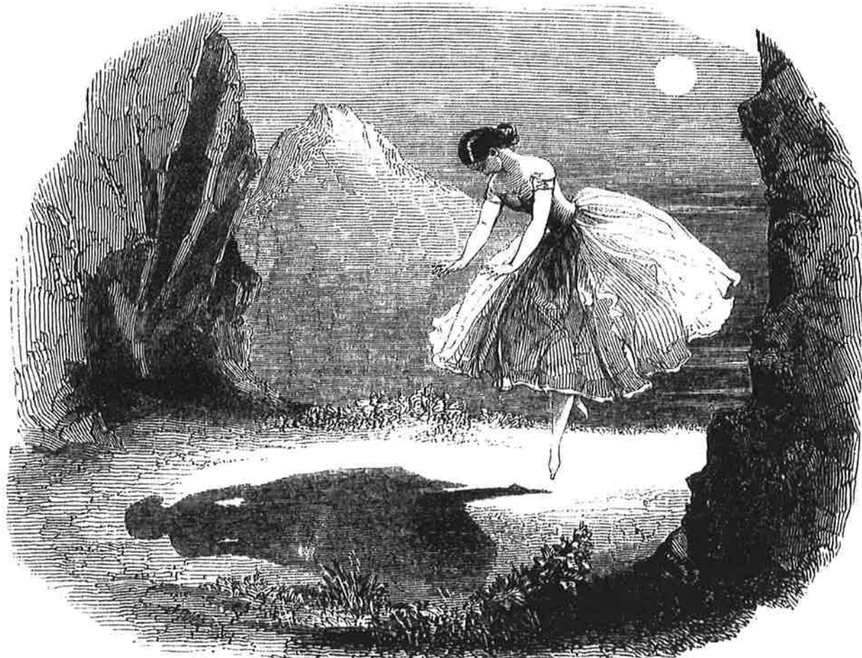
Variations on the water creature in love with a human being include Ondine, subject of a ballet danced in London in 1843 by one of the greatest 19th-century ballerinas, Carlotta Grisi.

Dvořák was apparently inspired by a lake in a small village, southwest of Prague, where he spent summers and holidays. He composed a good deal of music there, including Rusalka (it seems he saw a fairy standing above the lake). Instantly attracted to Kvapil's text, he began working on Rusalka in April of 1900. Incredibly, he was already finished with the full score by the end of November the same year. The honor of introducing the work went to Prague's National Theatre, which utilized all of its impressive resources vocally, orchestrally, and scenically, in order to do Rusalka full justice.